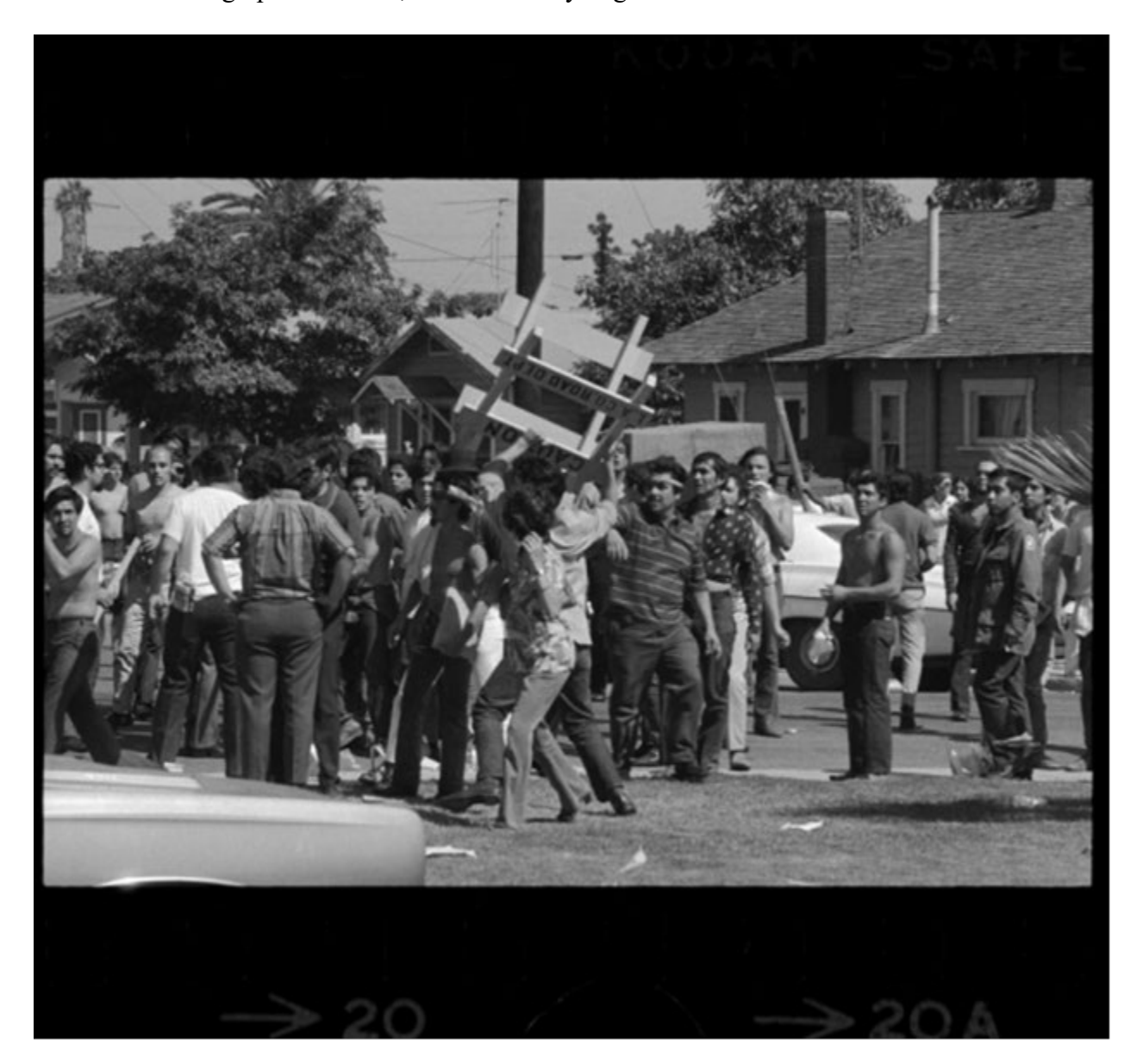
Figure 2. Antiwar demonstrators after the march, August 29, 1970.