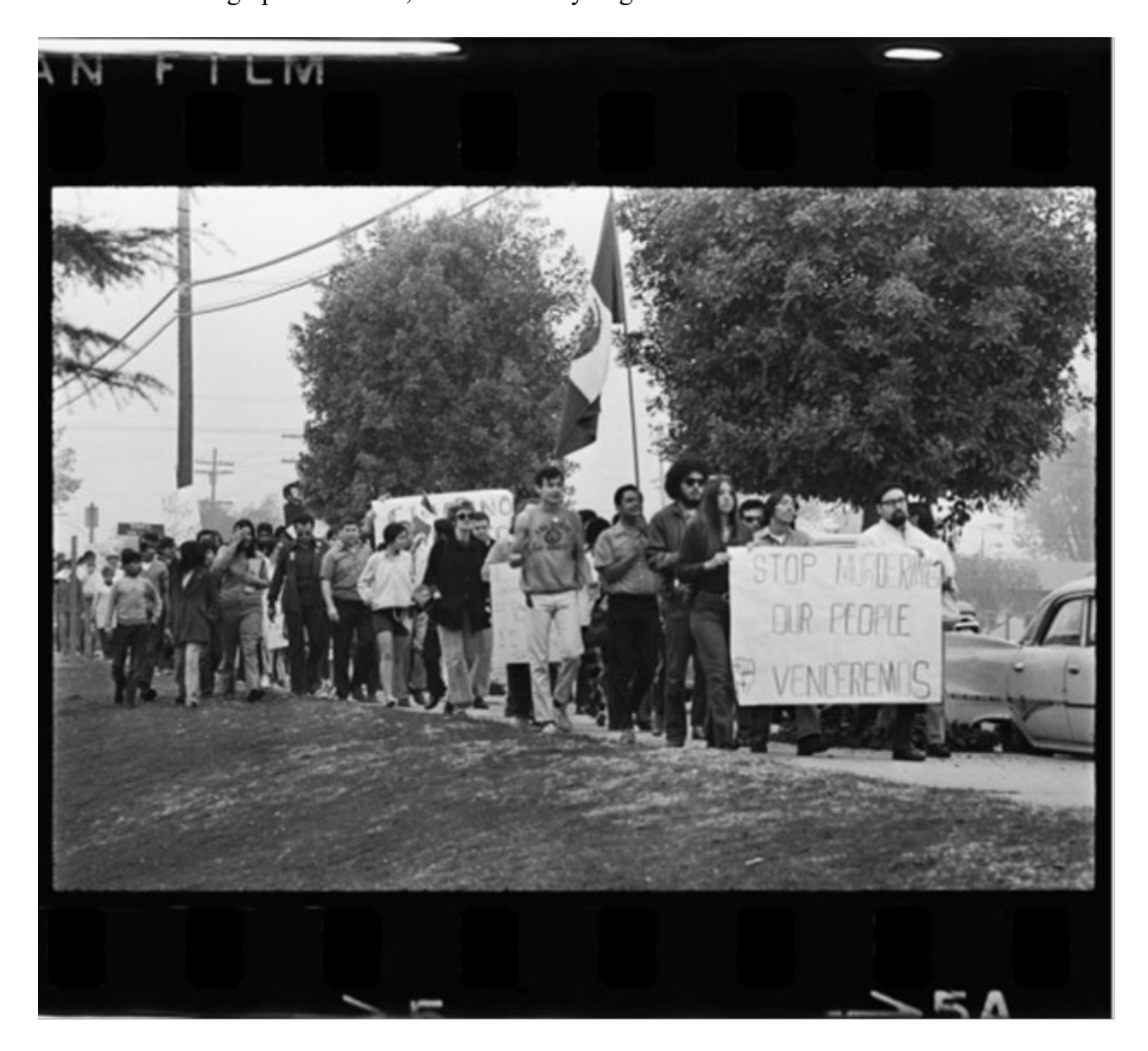
Figure 1. Antiwar demonstrators marching along route, August 29, 1970.